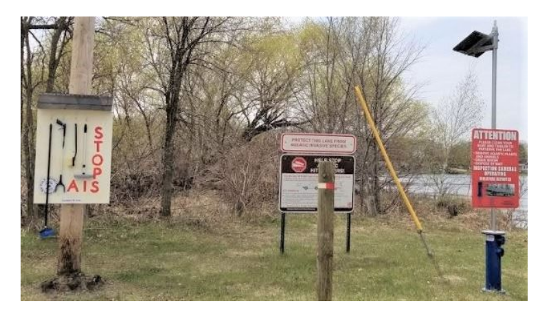
(This is a picture of the Tool Outpost and the I-LIDS camera that are installed at the East Shore boat landing.)

Snyder at Polk Co. Environmental Services office in Crookston.